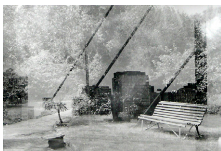
From the series Three Times a Day No1, 2010, © Beate Spitzmüller