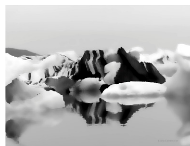
From the series Corpora No3, 2015