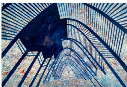
moves11 crawl, Athen OAKA Calatrava, 2019