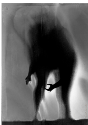
From the series A Contre Jour – ShapeChanging No1, 1993