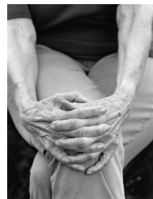
Astrids Hände, 2020, aus der Serie Immergrün