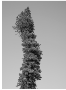
Pino, Palermo + Domenico, Palermo, 2024, aus der Serie Sicilia