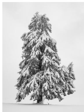
White 03, 2024, aus der Serie White