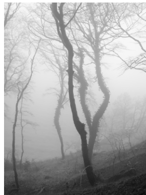
Graubaum 19, 2019, aus der Serie Graubaum und Himmelmeer, 2019-2023