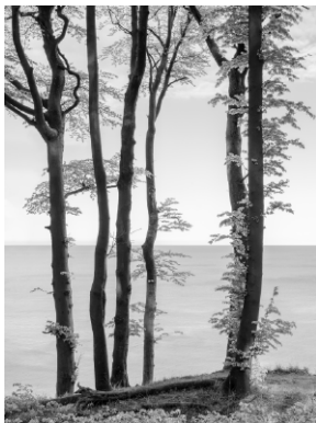
Graubaum 7, 2019, aus der Serie Graubaum und Himmelmeer, 2019-2023