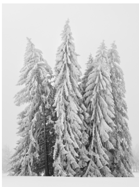
White 04, 2024, aus der Serie White