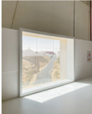
Untitled (JAX 01, Driyah), 2025