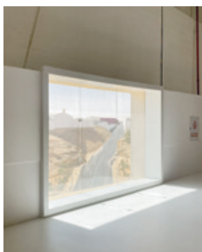
Untitled (JAX 01, Diriyah), 2025