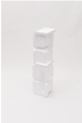
Tech Tower , from the series Metaphysics of Core Matter , 2020, © Silja Yvette