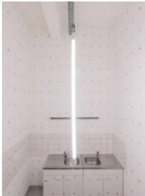
Dunkelkammer, 2021–2025