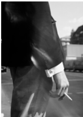
© Lukas Hoffmann, Strassenbild X , 2019