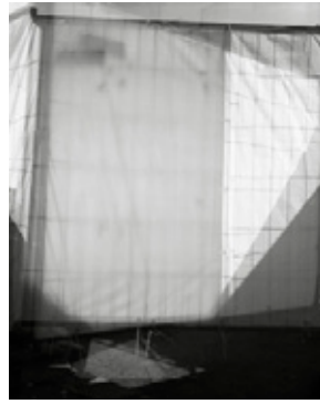
© Lukas Hoffmann, Doppelbelichtung (Rosenthaler Platz), 2024