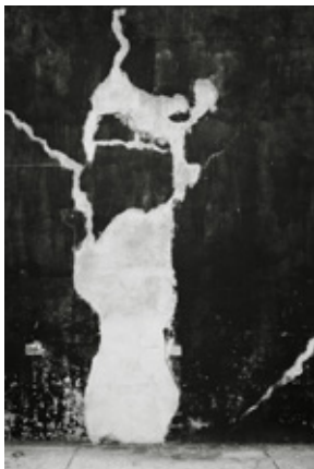
© Lukas Hoffmann, Bronx River Avenue NYC , 2016, Polyptych, Panel 3/6