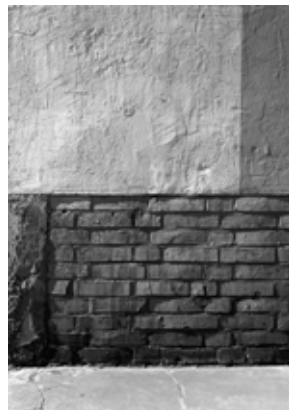
© Lukas Hoffmann, Marktstrasse, Berlin , 2018, Quadriptych, Panel 1/4

For these two multi-part works you can also request the complete view.