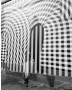
Doppelbelichtung (Wilmsdorfer Strasse 10, 2024)