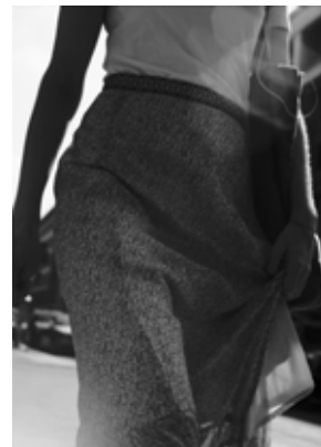
© Lukas Hoffmann, Strassenbild XIX , 2019