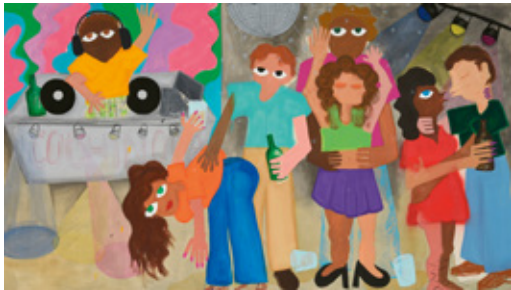
© Ximena Ferrer Pizarro, Reggaeton heals , 2022