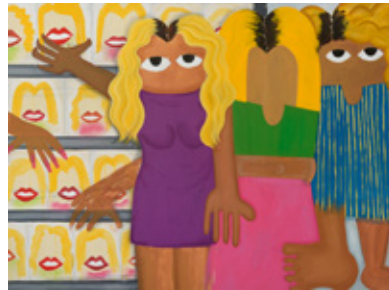
© Ximena Ferrer Pizarro, Blonde with her own money , 2023