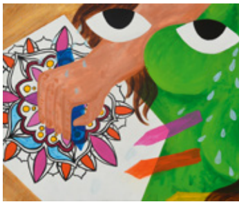
© Ximena Ferrer Pizarro, Alternative therapy , 2024