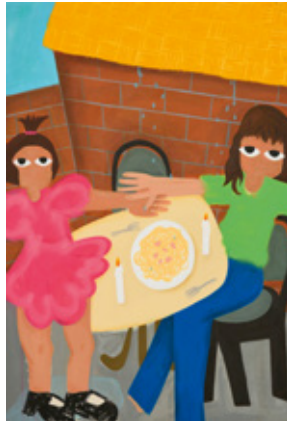
© Ximena Ferrer Pizarro, Where one can eat, two can eat , 2022