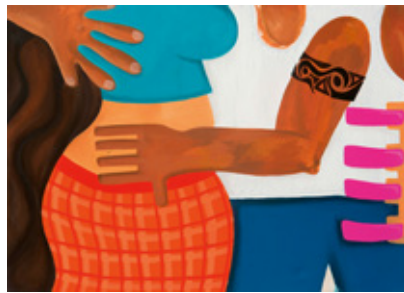
© Ximena Ferrer Pizarro, Salsa sensual , 2024