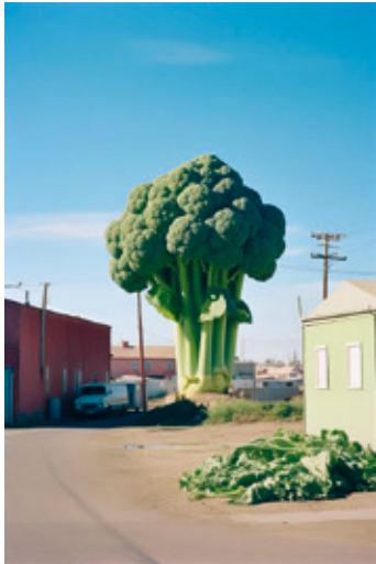
© Bruce Eesly, Broccoli farm near Limburg , 1962, from the series New Farmer , 2023