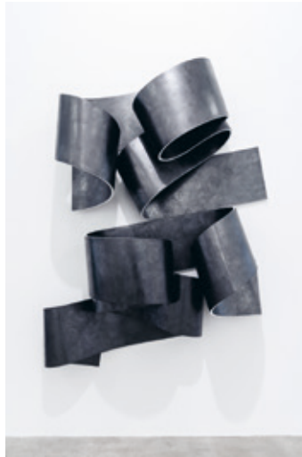
© Wanda Stolle, in between , 2024