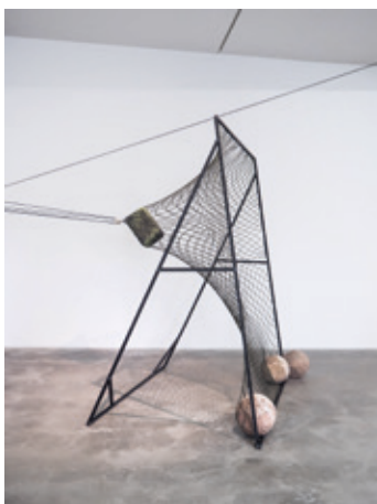
© Abie Franklin, stalemate , Exhibition view ZAK Spandau, 2024