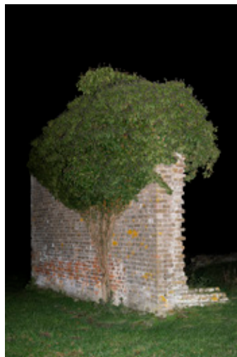
from the series „Typ/Traube/Tross“, 2021