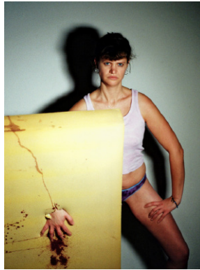
© Bob Jones, from the series each face stares , 2021