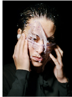
© Bob Jones, from the series each face stares , 2021