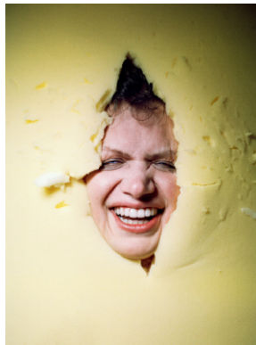
© Bob Jones, from the series each face stares , 2021