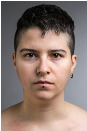
© Bob Jones, from the series Colère, ma mère, colère! , 2015