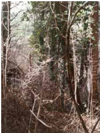
© Mirjana Vrbaški, o.T. 20, 2023