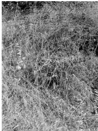
© Mirjana Vrbaški, o.T. 21, 2023