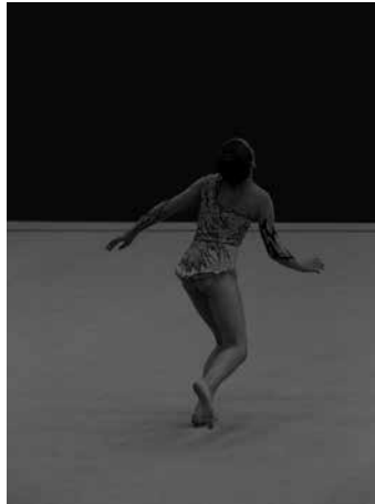
© Mirjana Vrbaški, The Practice (3), 2023