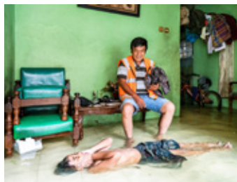
6°09'50.9"S 106°50'04.4"E, from Uncertain Homelands