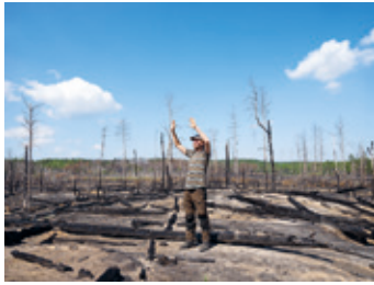
© Nora Bibel, from Uncertain Homelands , 2023