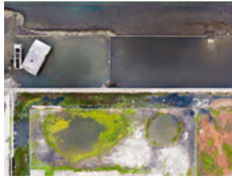
© Nora Bibel, 6°06'41.0"S 106°48'23.1"E, from Uncertain Homelands