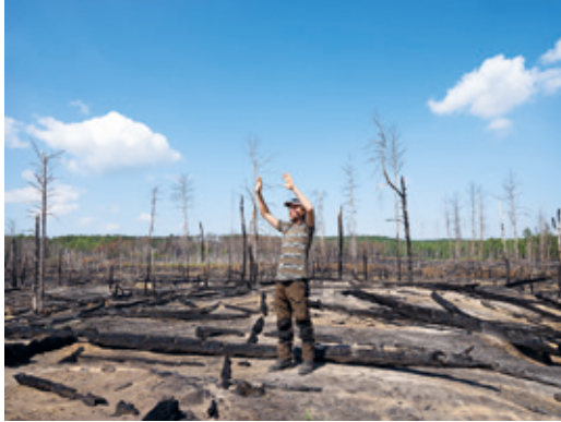
© Nora Bibel, from Uncertain Homelands , 2023

Water – too much of it and too little – is a focal point in new works by Nora Bibel, who artistically engaged with the consequences of climate change in Indonesia, Namibia, and Germany. Drone images of nearly abstract-seeming landscapes, portraits of people in their familiar environment, and photos of objects connected to the water industry come together and create a multi-layered conceptual space in the exhibition that deals with the topic of water in a powerful way, demonstrating that it is a globally connected and mutually influencing system.