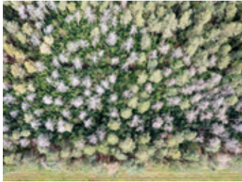
© Nora Bibel, 51°40'36.8"N 13°09'13.7"E, from Uncertain Homelands