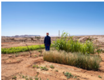
© Nora Bibel, 26°36'26.6"S 16°13'15.1"E, from Uncertain Homelands