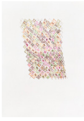
© Myriam El Haïk, „Rug“, from the series „Beni Ouarain“, 2023, Ink and pencil on paper, 41×29,7 cm