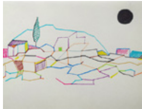
© Myriam El Haïk, „Landscape“, 2022, Ink on paper, 14,85×19,6 cm