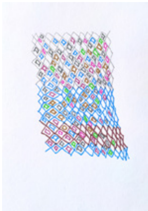
© Myriam El Haïk, „Rug“, from the series „Beni Ouarain“, 2023, Ink and pencil on paper, 21×13,5 cm