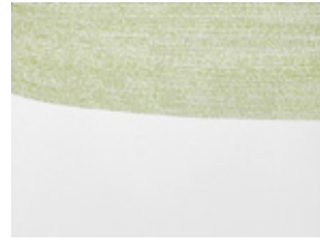
© Myriam El Haïk, „Silence“, 2022, Ink on paper, 24×17 cm