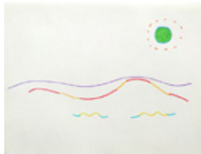
© Myriam El Haïk, „Landscape“, 2022, Ink on paper, 14,85×19,6 cm