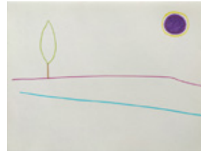
© Myriam El Haïk, „Landscape“, 2022, Ink on paper, 14,85×19,6 cm