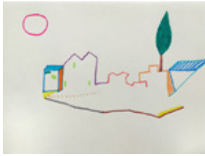
© Myriam El Haïk, „Landscape“, 2022, Ink on paper, 14,85×19,6 cm