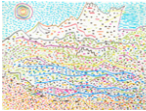
© Myriam El Haïk, „Landscape“, 2022, Ink on paper, 14,85×19,6 cm