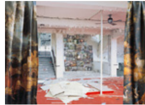
© Anett Stuth, „Paradise“, 2009, from the series RAUM-ZEIT-BILD.