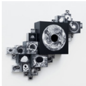
© Anett Stuth, „Loch in der Welt“, 2016, from the series WELTANSICHTEN.