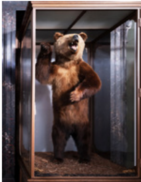
© Anett Stuth, „Object: Bear“, 2022, from the series REMAINS.