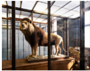
© Anett Stuth, „Object: Lion“, 2022, from the series REMAINS.