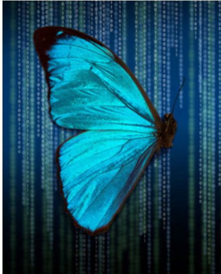
© Anett Stuth, „HALF MORPHO MENELAUS ON A DIGITAL ALGORITHM“, from the series „REMAINS“, 2022

Under the wide-ranging and suggestive title TIME LOOPS Anett Stuth presents photographic works which reflect on nature's sublimity and simultaneous destruction. The current exhibition features photographic collages and decollages of pieces of nature, plant and animal objects, and remains from the recent and prehistoric past as well.