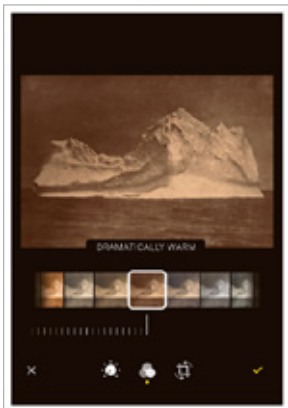
© Anett Stuth, „DRAMATICALLY WARM“, 2019, from the series MELTED TIME.