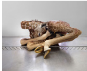
© Anett Stuth, „Frozen Baby Giraffe“, 2022, from the series REMAINS.