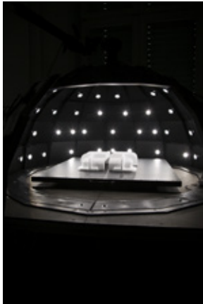
© Silja Yvette, „Revalue Dome II”, 2021, from the series “METAPHYS- ICS OF CORE MATTER”, Photography, 120 × 80 × 5 cm