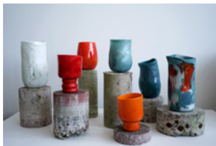
© Sonya Schönberger, „Die Party ist vorbei”, 2022, (Installation view)