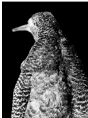
„Philomachus pugnax“ © Nadja Bournonville, 2020 Natural History Museum Vienna from „A worm crossed the street“