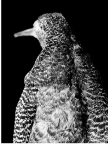
„Philomachus pugnax“, © Nadja Bournonville, 2020

In her latest artistic project “A worm crossed the street”, Nadja Bournonville trains her eye on nature, species variety, concepts of display, animal extinction, and how we deal with it. Not only are the taxidermied animals in the archives a relic of their former existence, but, at times, of their entire species.