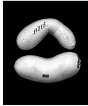
„Gallus domesticus“ © Nadja Bournonville, 2020 Natural History Museum Vienna from „A worm crossed the street“