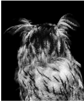
„Ptilopsis leucotis“ © Nadja Bournonville, 2020 Natural History Museum Vienna from „A worm crossed the street“