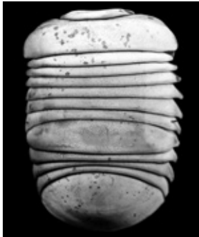
„Sphaerotherium hippocastanum“ © Nadja Bournonville, 2020 Natural History Museum Vienna from „A worm crossed the street“