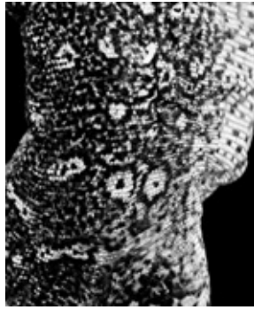
„Varanus Gouldi“ © Nadja Bournonville, 2020 Natural History Museum Vienna from „A worm crossed the street“