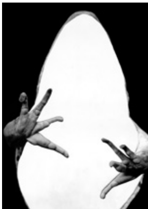
Untitled, Collage © Nadja Bournonville, 2020 Natural History Museum Vienna from „A worm crossed the street“