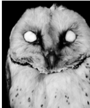
„Tyto alba affinis“ © Nadja Bournonville, 2020 Natural History Museum Vienna from „A worm crossed the street“