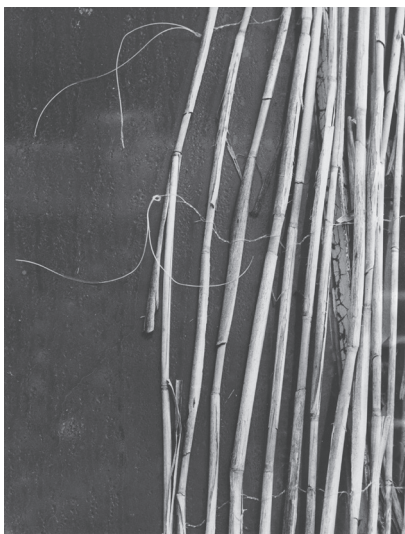
© Marie Kratochvilová „580“ aus der Serie „Botanik“, 1978