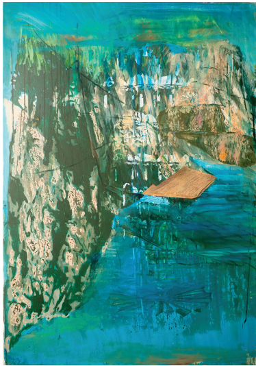
© Ina Bierstedt „Dach und Fels“, 2020