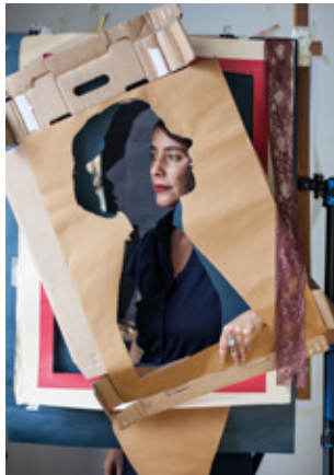
„Dear Hannah (Höch) I“, 2019