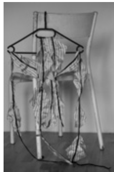
„Dear Louise (Bourgeois) III“, 2019–2021