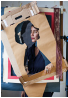
„Dear Hannah (Höch) I“, 2019–2021